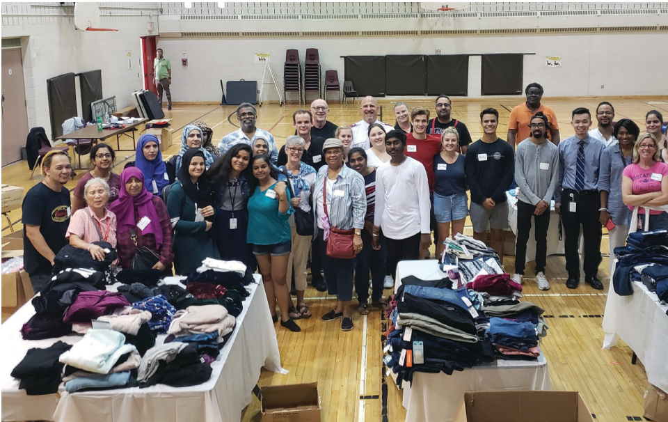
Residents, volunteers and organisers at the 'Back to School Donation Drive' for 650 Parliament street residents