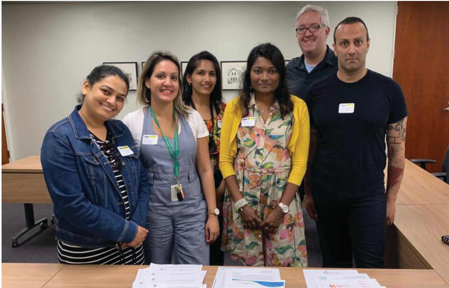
Residents along with The Corner staff and representatives of the St. James Town Service Providers' Network, submitting the petition to designate St. James Town as a Neighbourhood Improvement area at the City Councillor's office