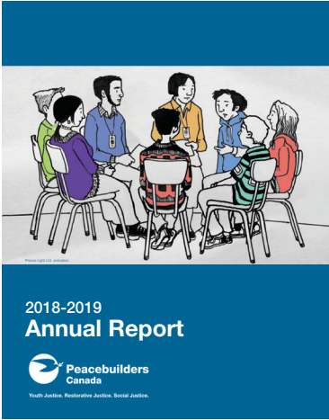
Peacebuilders Canada 2018-2019 Annual Report

By tackling global climate issues at a local level, the space will focus on 3Rs – Reduce, Reuse and Repair. The primary focus of The Corner@240 is to help residents repair, reuse and repurpose items to prolong their life, hence saving money, effort and resources. The space will also feature a ‘Library of Things’ where residents can borrow items such as tools, kitchen equipment, party equipment, sports and camping equipment and board games for a stipulated period of time. We hope that by building an environment of sharing and trust, we can destigmatize the neighbourhood’s criminalized stereotype whilst simultaneously enhancing social connections within the community.