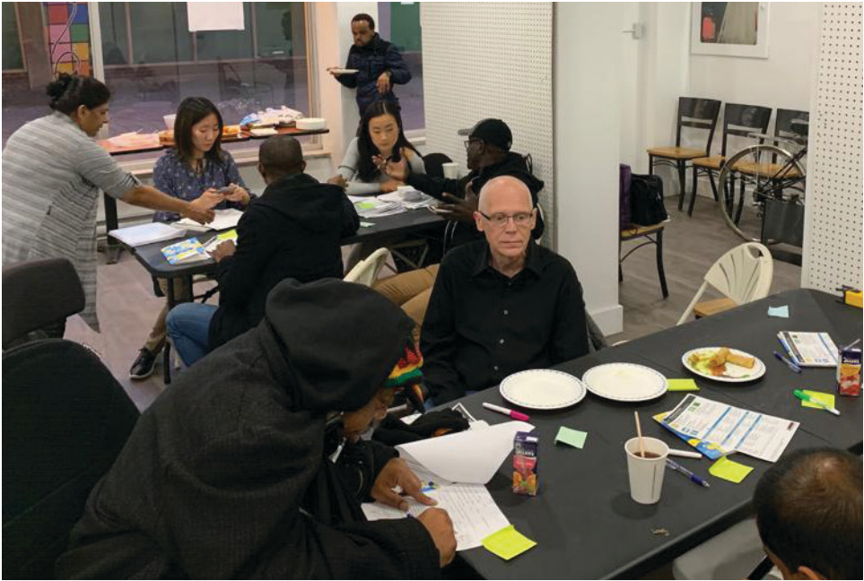
Left: A resident casting a mock vote at a Vote Pop-up event. Right: Resident participants during a Vote Pop-up event