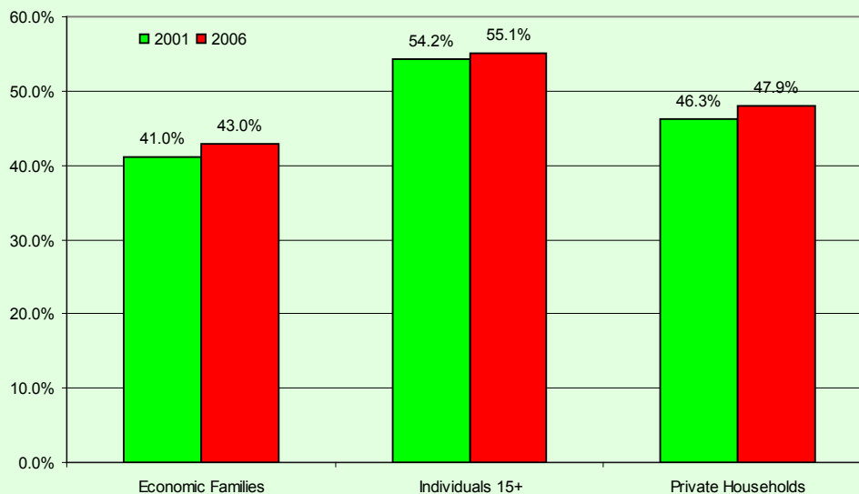
Incidence of Low Income (%), 2001-2006